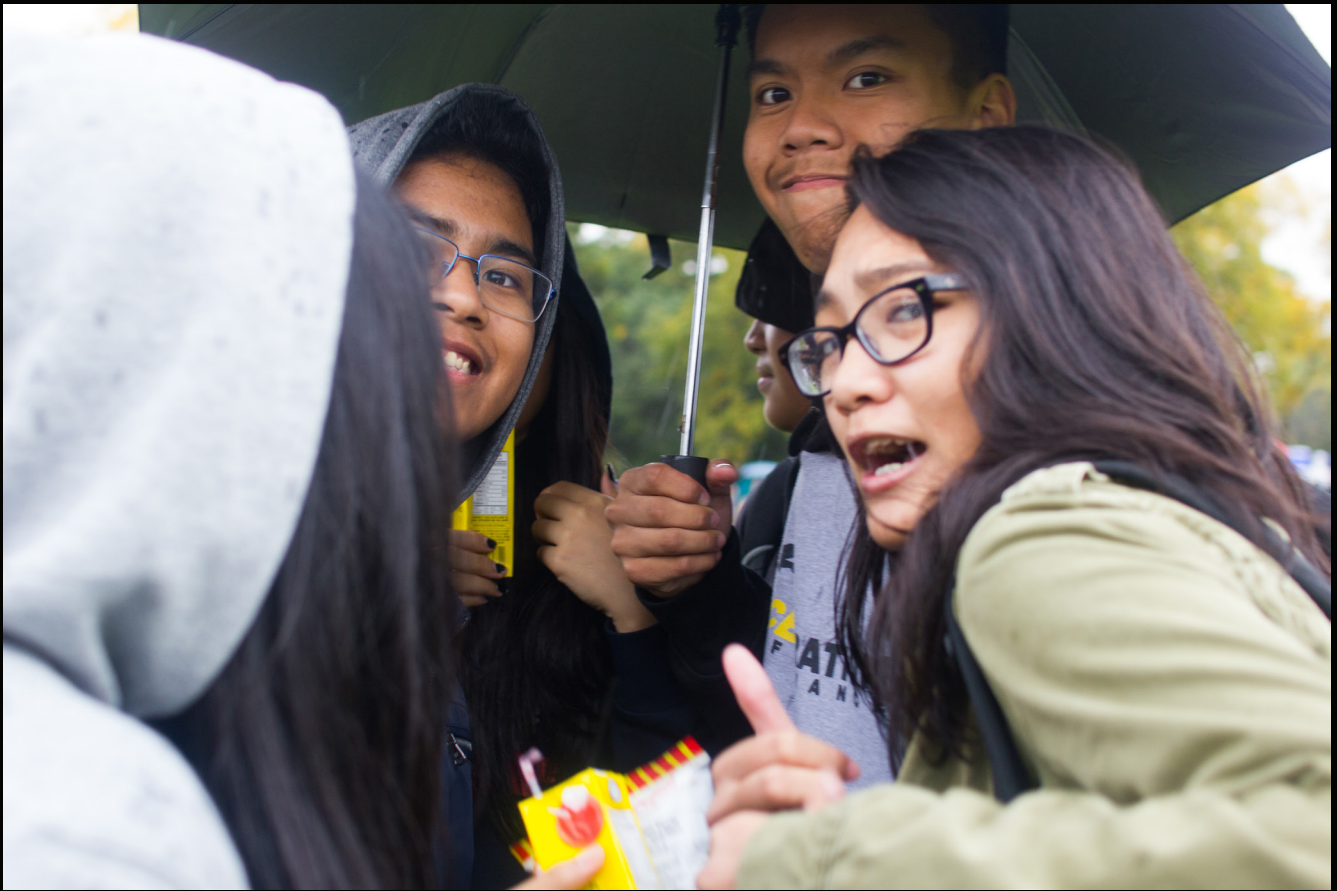
I don't think they can all fit...