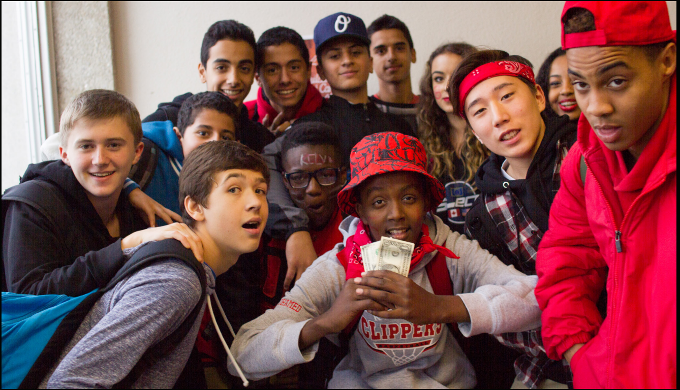
Homecoming squad - "YO TAKE OUR PHOTO!"