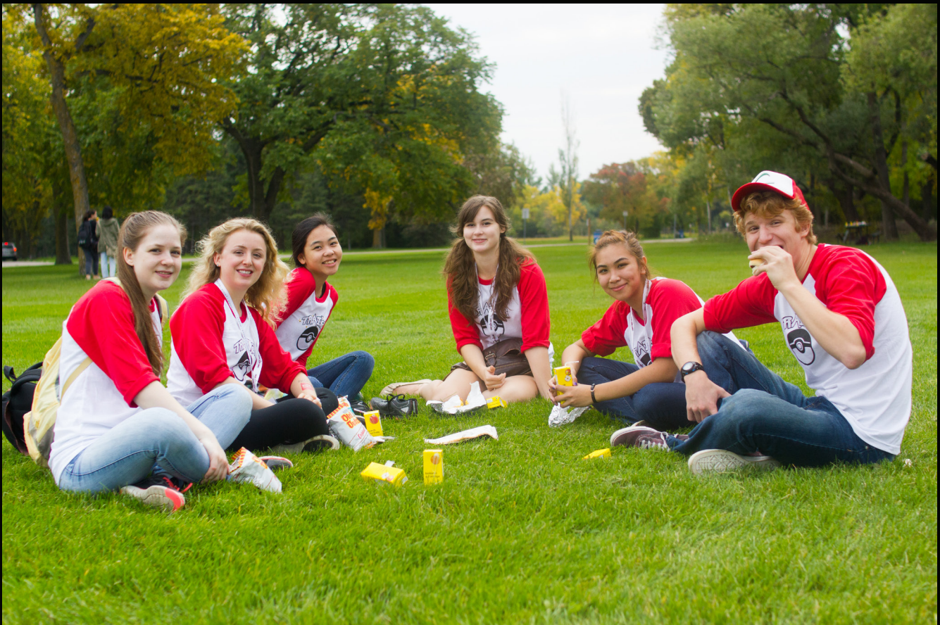
Meeting new people, mentors and grade nines alike.