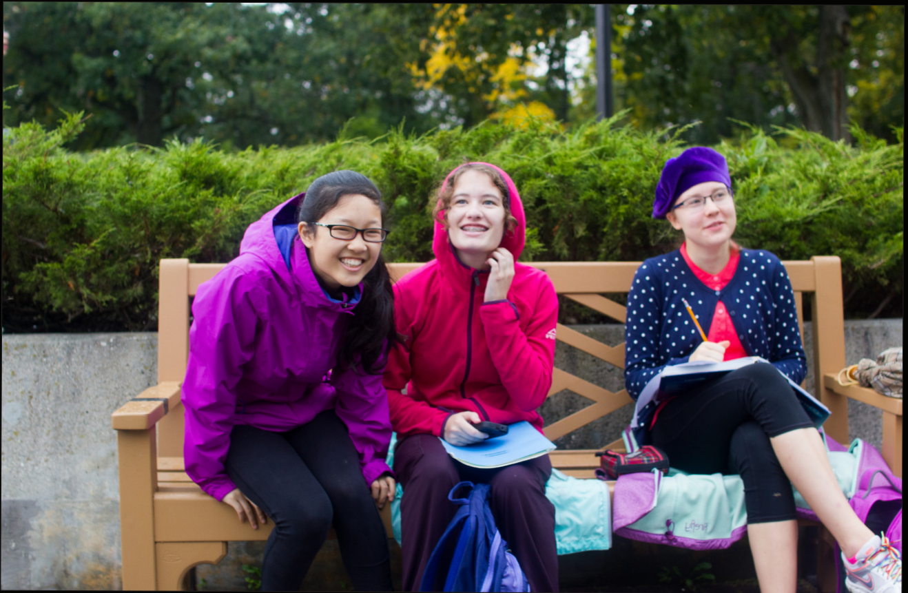
An hour into the Walk-A-Thon, 10 minutes into the storm, sadly already waiting for a ride home.