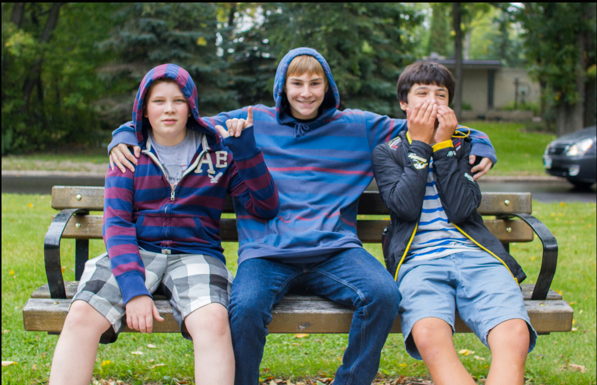
Great friends and harmonica tunes.