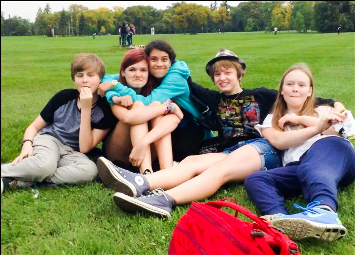
Looks like a sitcom, doesn't it?