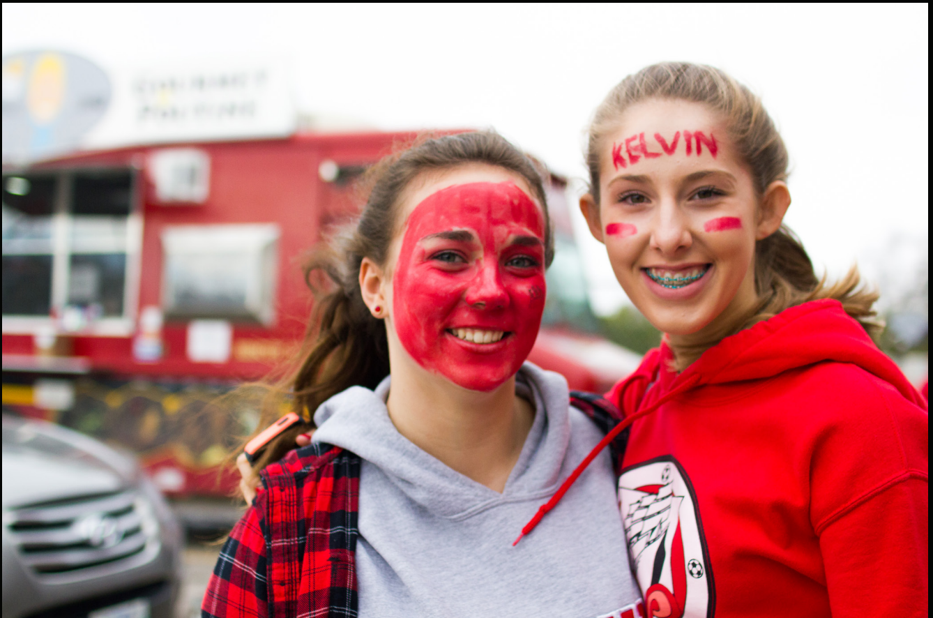
Red sweaters, shirts, faces and food trucks.