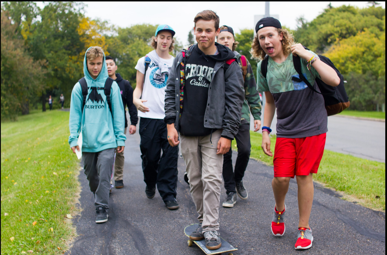
"Can I take your photo?" "Nope." "I'll get you in the paperclip" *Everyone poses*