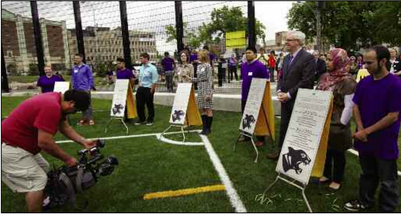
Unveiling a series of plaques that will be erected at the field in tribute to the many donors that made the facility possible, as well as the students and community activists that pushed the project to fruition. A fifth plaque will be erected on behalf of the Province of Manitoba and the Division.