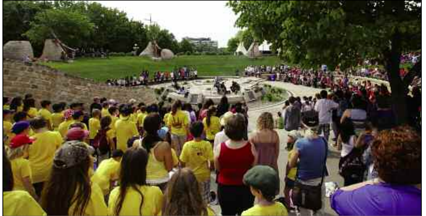
Students and teachers in the round at The Forks' Oodena Centre.

Students from across the Winnipeg School Division joined residential school survivors and other guests at The Forks on June 20 for the national Project of Heart.