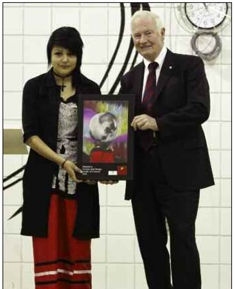
Governor General of Canada, David Johnston, receives a plaque from a Children of the Earth student.

His Excellency the Right Honourable David Johnston, Governor General of Canada, visited Children of the Earth High School this past June.