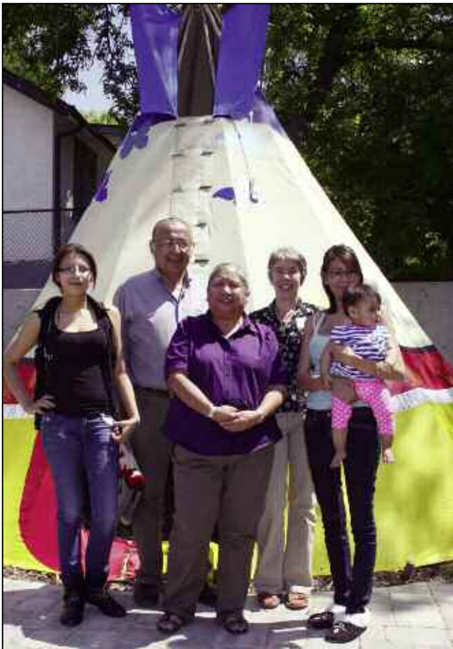
The new Villa Rosa teepee.