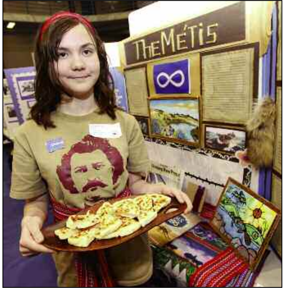
This J.B. Mitchell student studied Canada's Métis.

B udding history buffs gathered en masse at the University of Winnipeg's Duckworth Centre for the annual Red River Heritage Fair.