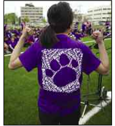
Ecstatic students gave their new Greenspace facility a resounding thumbs up.