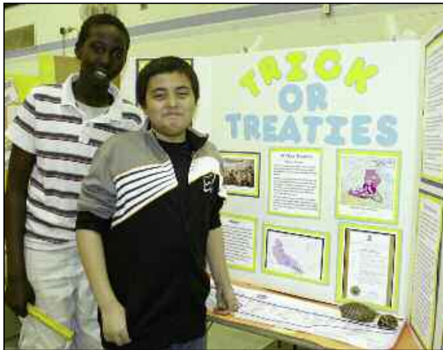
Students with their Heritage Fair project on treaties.

Canada's complex relationship with its Aboriginal community was a recurring theme at River Elm School's Heritage Fair.