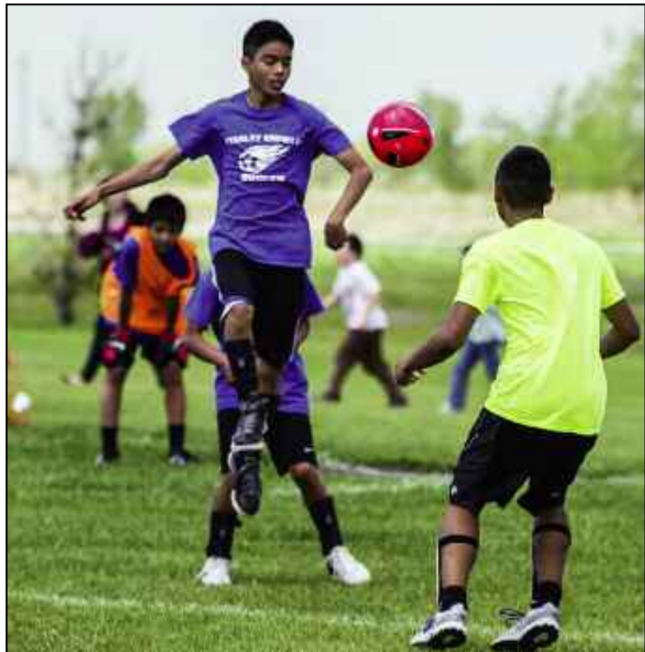
A Stanley Knowles student soars during the soccer finale at the school.

"The kids were very passionate about it and wanted to learn more. It's the best way to educate non-Aboriginals about Aboriginal culture and to increase the Aboriginal students' pride in their culture."