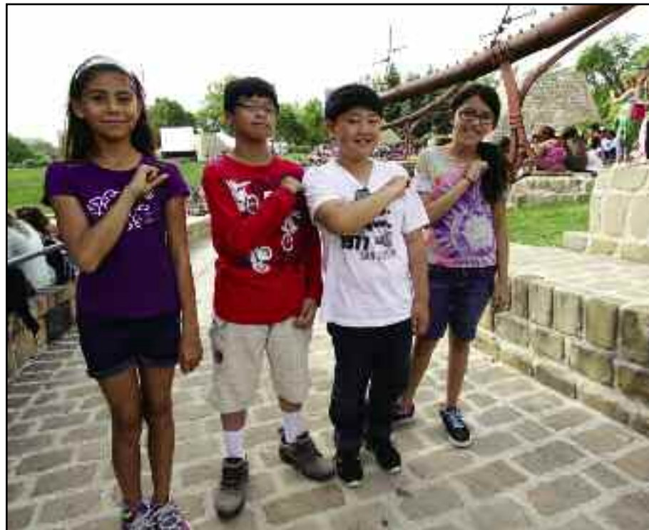
Clifton students were among hundreds of students showing their support for residential school survivors and victims at The Forks.