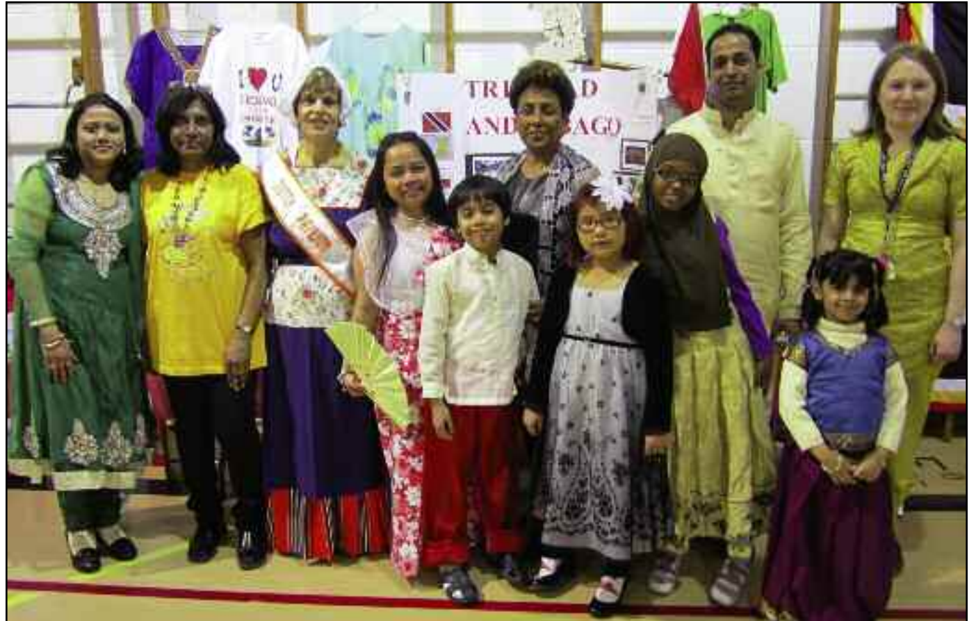
Festival-goers stand in front of the Trinidad and Tobago display at Fort Rouge School.

The families had a fun time doing crafts, posing in the photo booth and getting henna tattoos. The evening