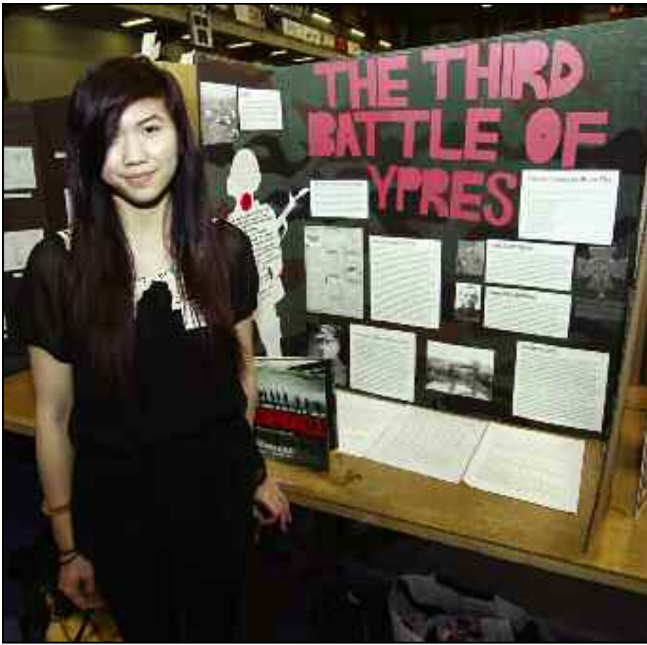
A Sisler High School student with her project on the Third Battle of Ypres/Passchendaele.