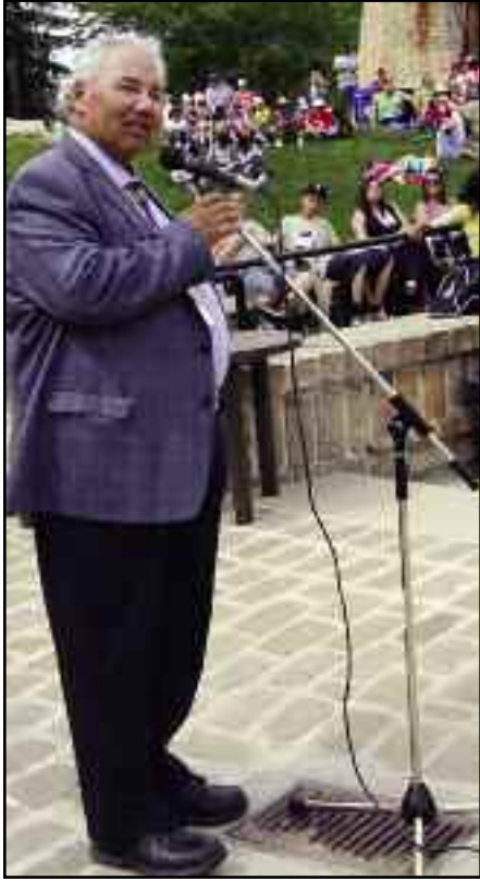
Honourable Justice Murray Sinclair (who is also Chair of the Truth and Reconciliation Commission of Canada and a residential school survivor) addresses the crowd at Oodena Centre.

Honouring the victims and survivors of Canada's Residential School System