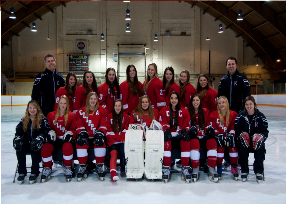
Great work Clippers! Our boys and girls hockey teams are always a source of pride!