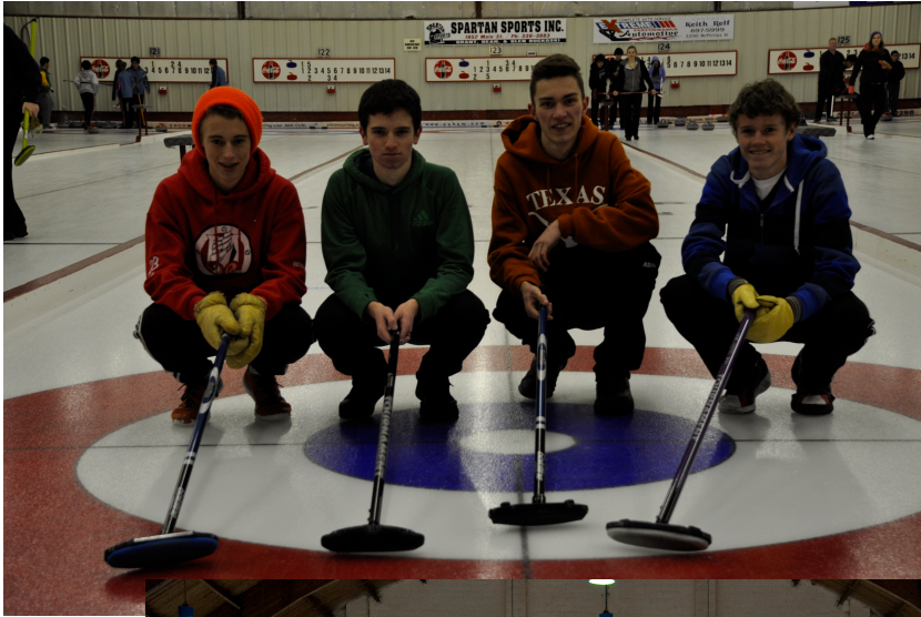
Kelvin's boys and girls curling teams are awesome! Way to go!